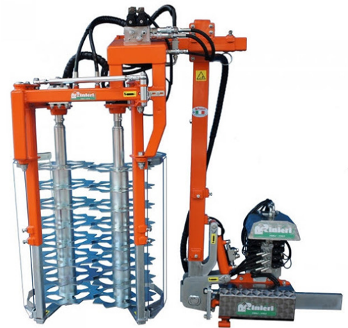
CPL Vision 1 8+8

The CPL Vision pre-pruner machine removes vine canes and is ideal for all varieties of vineyards. This trimmer/hedger aids in the efficient vine management and cost containment, leaving only the vines closest to support canes to clear, reducing pruning time by at least a third. All lateral movement takes place on bearings, making the frame very solid and damage resistant. This model provides excellent visibility and its inclination feature allows for use even on side slopes. Designed so the removing of shoots doesn't damage the wires, with pole bypass controlled by the operator through electrical control.